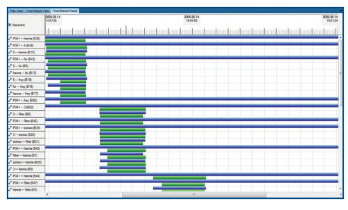
Processing GNSS Baselines