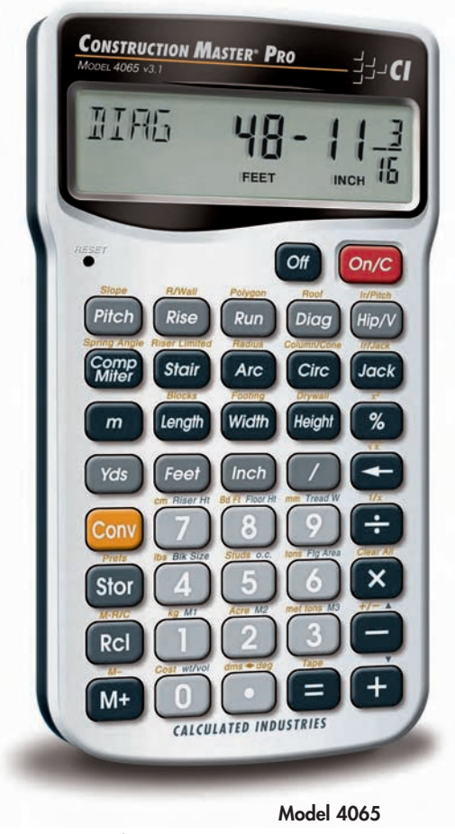
Easy-to-use, the Construction Master Pro answers the challenge for fast, accurate solutions in the office or on the jobsite