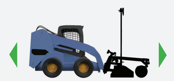
Grades in both directions